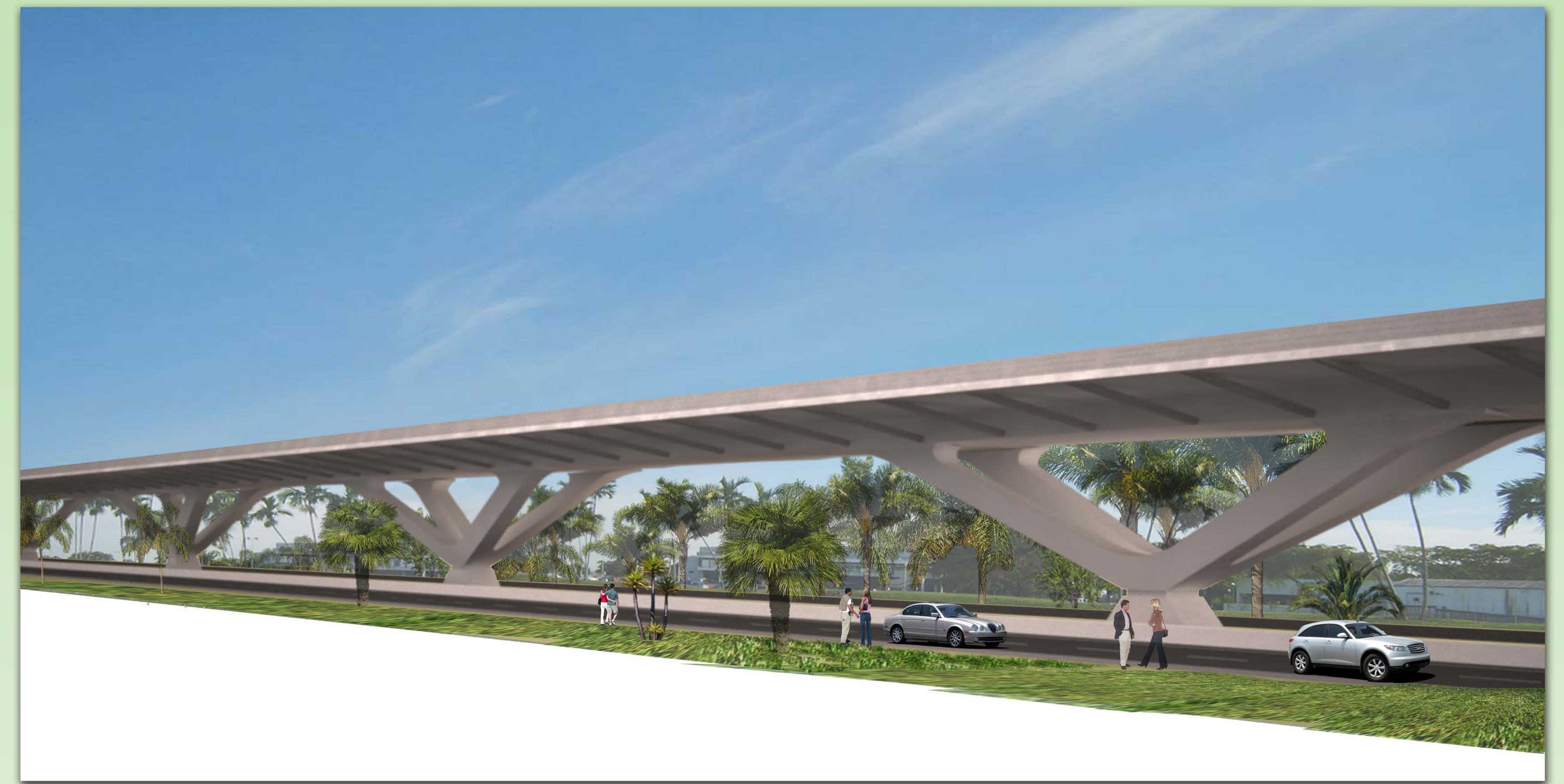
240ft. SPANS ALTERNATIVE A