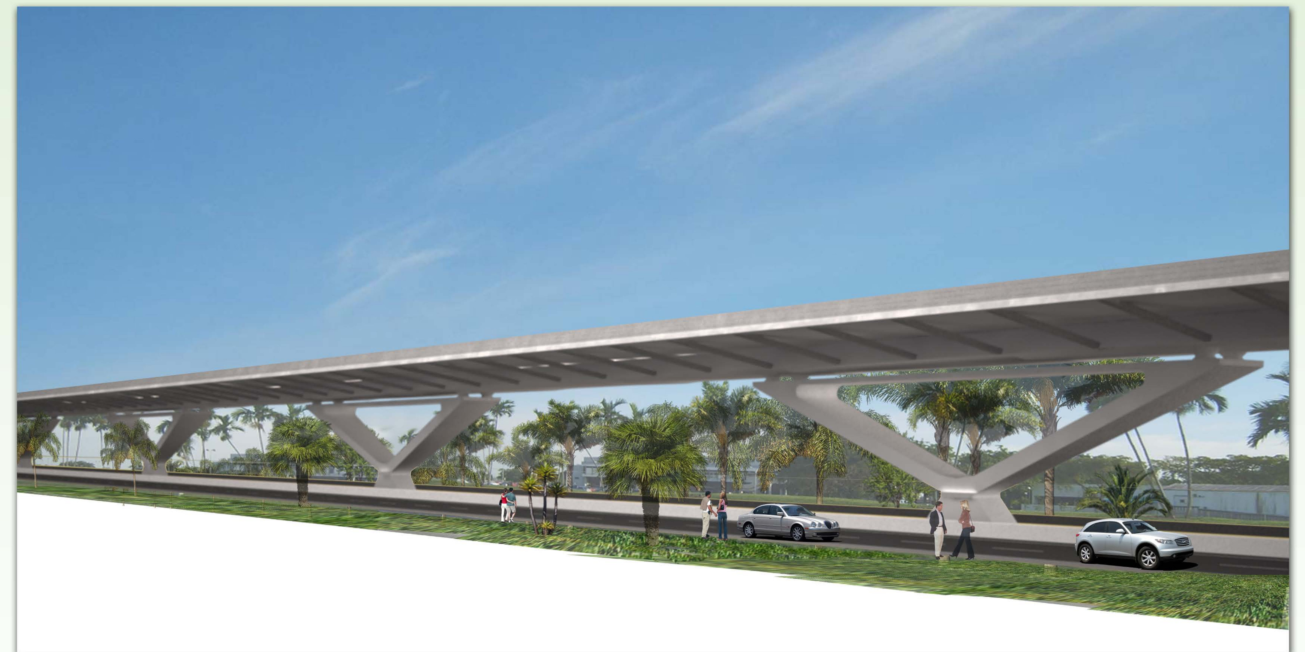
240ft. SPANS ALTERNATIVE B